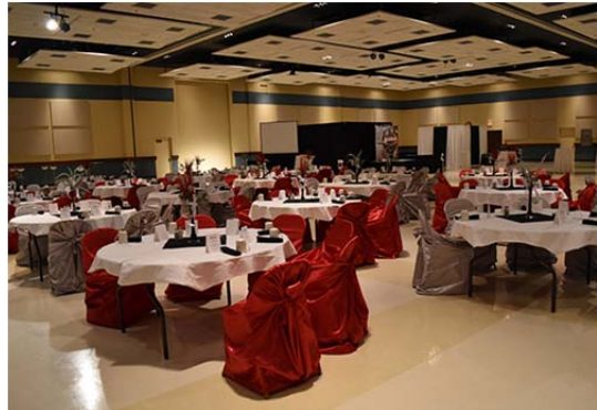
Salina has multiple and diverse meeting spaces throughout the community. Pictured is Heritage Hall at the Salina Bicentennial Center.

Salina has more than 30 lodging facilities that provide 2,000+ room accommodations . Diverse meeting facilities can seat from 10 to 7,000. Salina is home to excellent cuisine served at 80+ dining establishments .