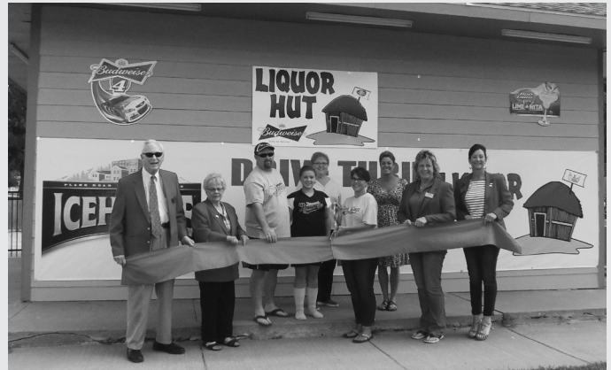
Liquor Hut , 837 N. Santa Fe, celebrated their recent opening with a Chamber ribbon cutting.