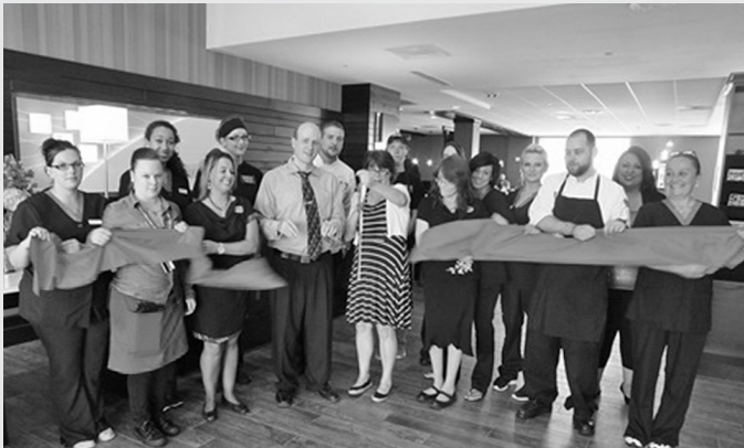
Holiday Inn , 3145 S. Ninth, recently opened and celebrated with a Chamber ribbon cutting and Business After Hours.