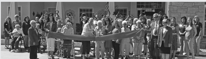
Brookdale Salina Kirwin , 1200 E. Kirwin and Brookdale Salina Fairdale , 2251 E. Crawford recently celebrated their re-branding with Chamber ribbon cuttings.