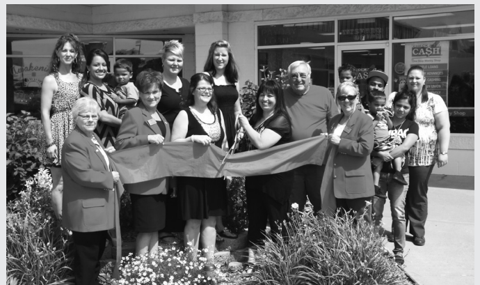
Awakening Day Spa , 2100 S. Ninth, Suite G, recently opened and celebrated with an open house and Chamber ribbon cutting.