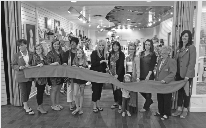
Simply Baby & More , 2259 S. Ninth, recently relocated to the Central Mall and celebrated with an open house and Chamber ribbon cutting.