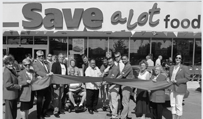
Save a Lot Food Store , 511 E. Iron, celebrated recently with a grand opening and Chamber ribbon cutting.