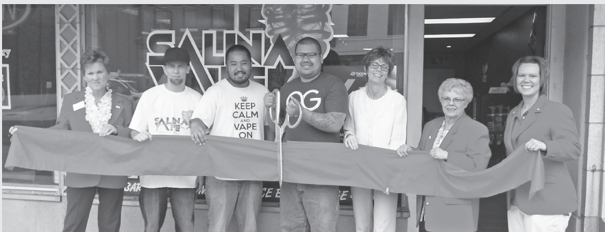
Salina Vape, LLC recently opened at 117 E. Iron, and celebrated with a grand opening and Chamber ribbon cutting.