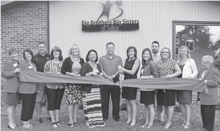
Big Brothers/Big Sisters recently relocated to their new facility at 500 Kenwood Park Drive and celebrated with a Chamber ribbon cutting.