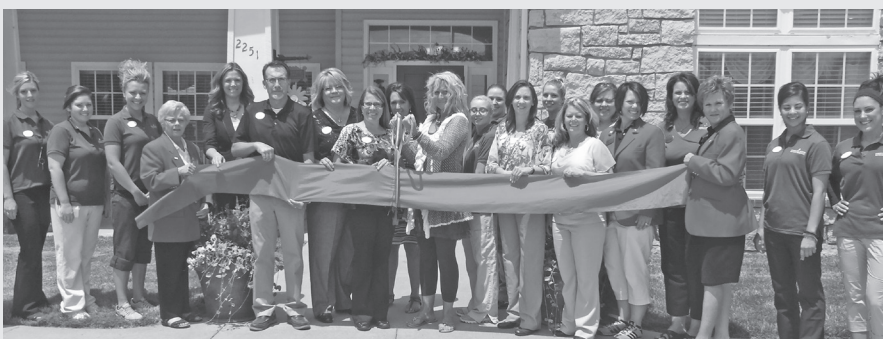
Sterling House Fairdale , 2251 E. Crawford, recently completed a major remodeling and renovation project and celebrated with an open house and Chamber ribbon cutting.