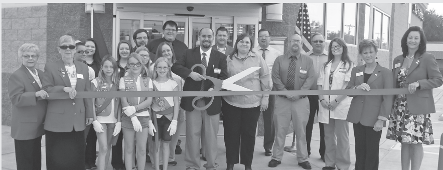
CVS Pharmacy recently opened at Crawford and Ohio, and celebrated with a grand opening and Chamber ribbon cutting.