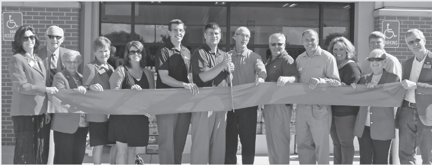
KWIK Shop recently opened their new expanded facility at 1727 W. Crawford, and celebrated with a grand opening and Chamber ribbon cutting.