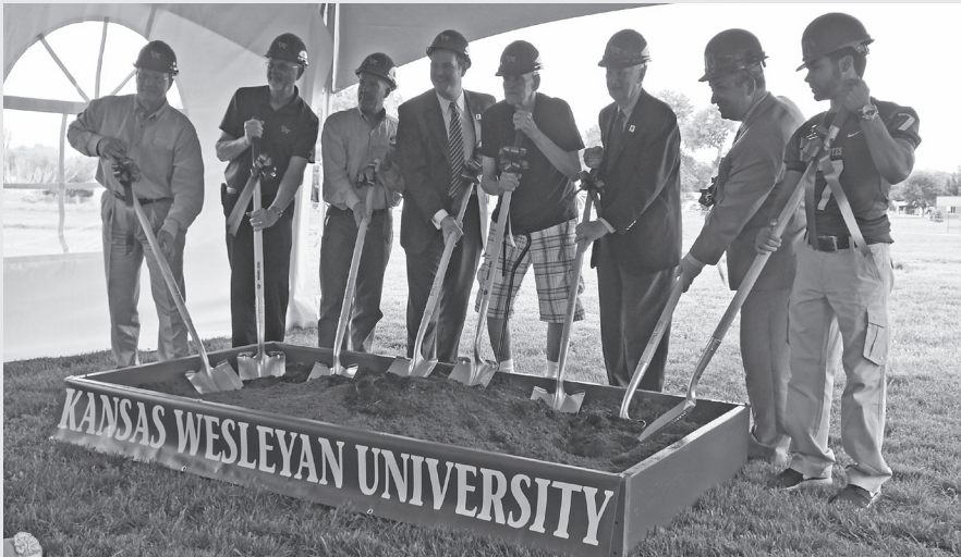
Kansas Wesleyan University held a ground breaking for their new football complex.